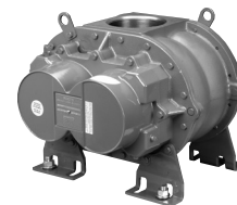
Horizontal gear end