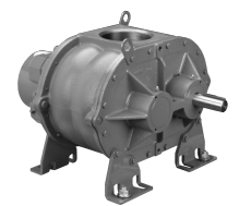
Horizontal drive end