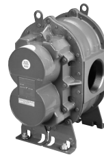
Vertical gear end

ROOTS™ Universal RAI® blowers are warranted for two years plus an additional 6 months for shipping and construction where required. ROOTS synthetic oil is recommended for longer lubricant life.